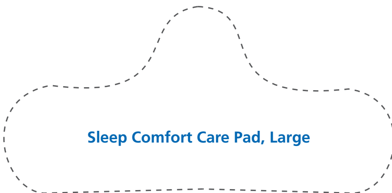
Sleep Comfort Care Pad, Large

Large pad should be 4.18" at its greatest width & 2.0" at its greatest height.