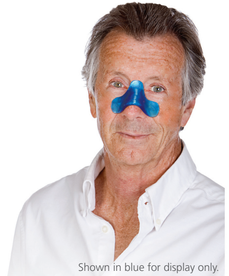
Shown in blue for display only.